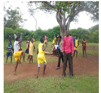
Pupils and teachers of Bukhulungu celebrate after qualifying for the finals

"I have seen some boys and girls with immense potential and who can turn into great players if given proper training," he said.