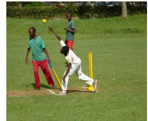
Action during the Nairobi mini-cricket event held at Ruaraka